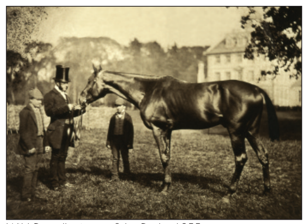
Wild Dayrell, winner of the Derby, 1855.