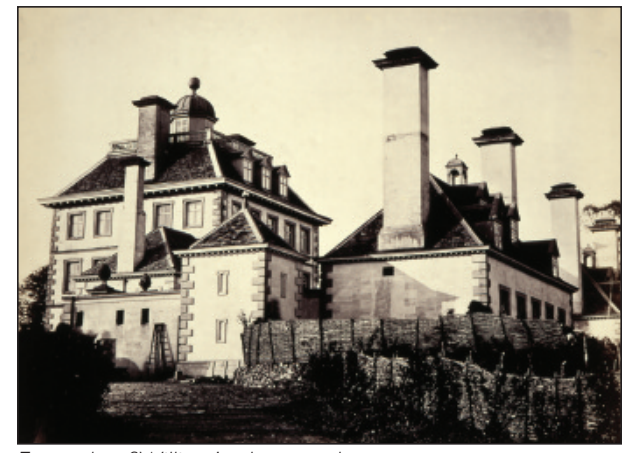
Example of William's photography.